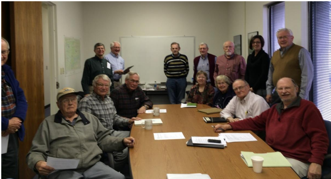
The FORNL Board meets monthly at the UT Center in Oak Ridge